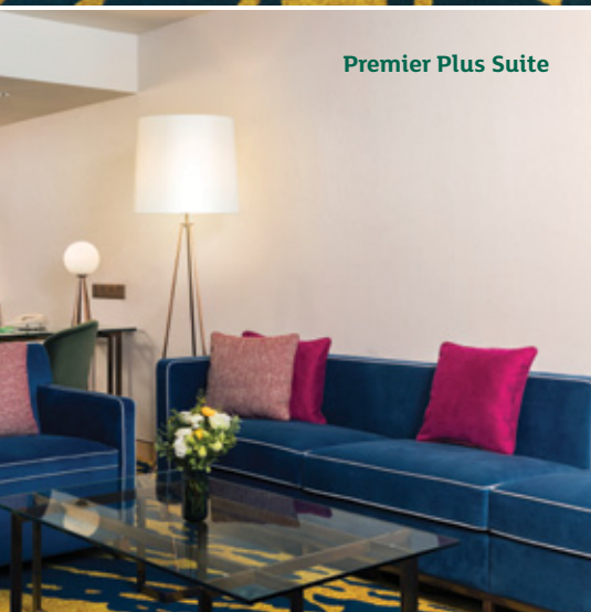
Premier Plus Suite

All guestrooms also feature the latest handy smartphone, guests can use the phone throughout the stay, with unlimited data and complimentary calls to Hong Kong, China, Taiwan, Thailand, Philippines, India, UK, France, Germany, Israel and Australia.