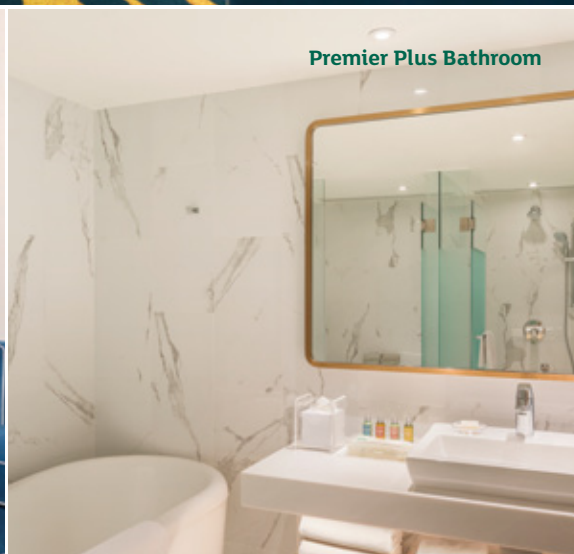
Premier Plus Bathroom