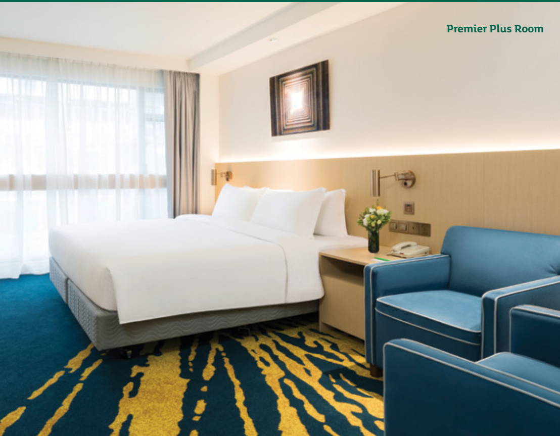
Premier Plus Room

Nestled in the very heart of Kowloon's bustling city centre, the Holiday Inn Golden Mile Hong Kong offers business and leisure travellers a vibrant location, contemporary conveniences, and all the luxuries of home while away.